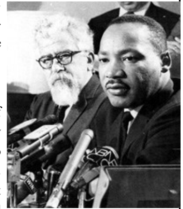
Rabbi Heschel and MLK

Despite the controversies, the Jewish Federation of Central California currently serves all facets of Fresno area Judaism. Its executives and board members can't hope to merge the varied religious philosophies or practices at events. However, as an umbrella organization, we feel a responsibility that crosses fixed lines.